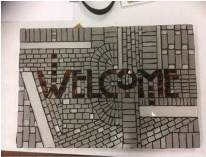
Above is one of Loretta's pieces